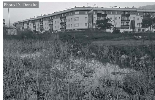
Figure 1. Locality of Jerez de la Frontera.

Complete albinism has also been discovered in heavily-populated southern Jerez de la Frontera, where the species continues to breed in a shallow pond bordered by apartment buildings and highway N-IV (Figure 1; N36.66963 / W6.14593; 17 masl) on former